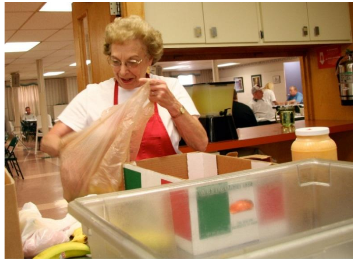
St. Stephen's Table (Pittsfield, Massachusetts) serves nearly 200 nutritious meals each week to needy men, women, and children on Thursday and Friday evenings throughout the year.

The past six months have been filled with confusion and questions about where networks, both official church committees (Jubilee Advisory Committee) and the organic networks (ENEJ) would land. Depending on the proposed budgets available for viewing leading up to General Convention, Jubilee and ENEJ were either in or out. Specific to Jubilee, two resolutions were